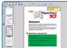
Add annotations to scanned images: notes, basic text, highlights, lines and arrows, stamps.