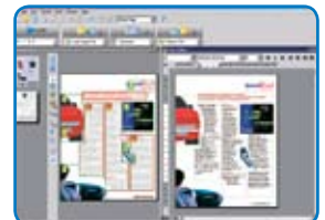
Capture text from PDF files and automatically save it as a fully editable, fully formatted Word document.

Konica Minolta Business Solutions (M) Sdn Bhd 1, Jalan 13/6, 46200 Petaling Jaya, Selangor Darul Ehsan, Malaysia.